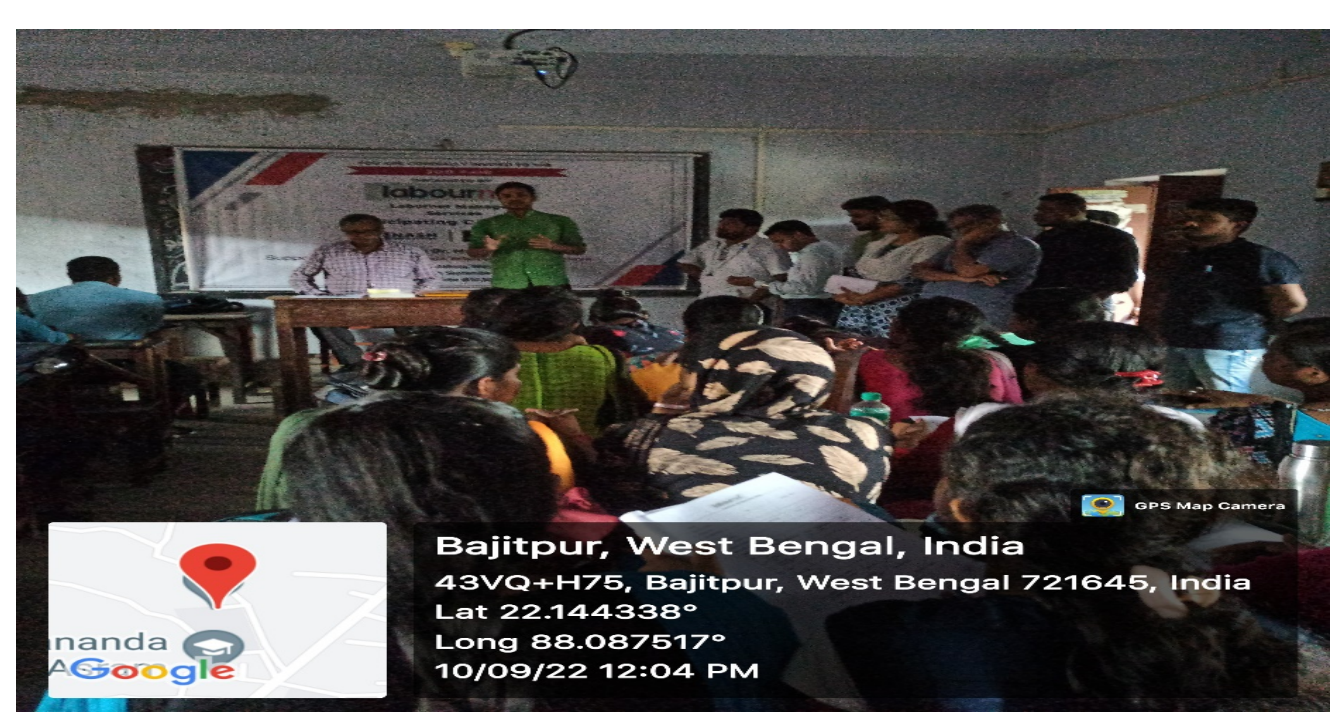
JOB FAIR ORGANISED BY AKSHAREKHA