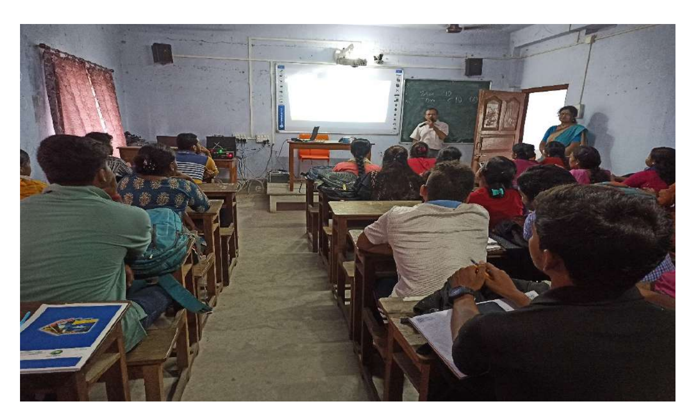
TCS YEP CLASS

Phone No: 03224 286223, 03224 287440, Email Id: vmmahavidyalaya@gmail.com