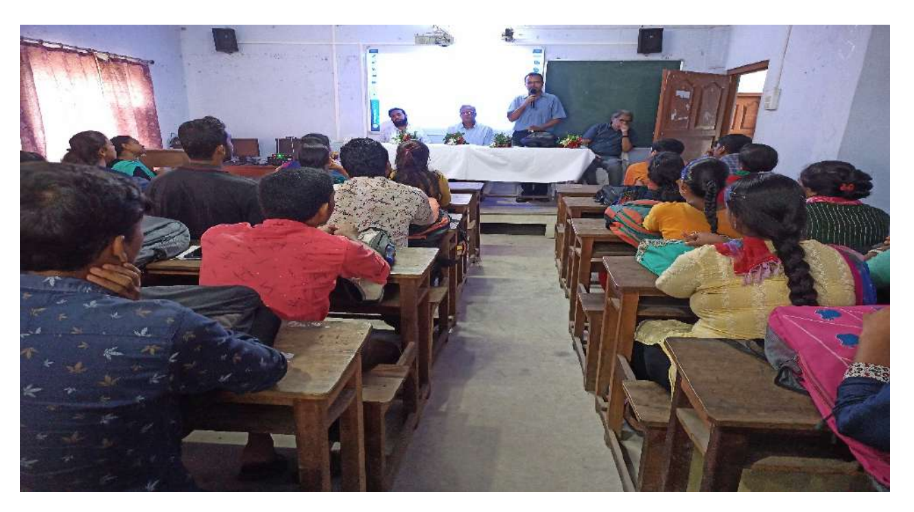
TCS YEP INAUGURATION PROGRAMME

Phone No: 03224 286223, 03224 287440, Email Id: vmmahavidyalaya@gmail.com